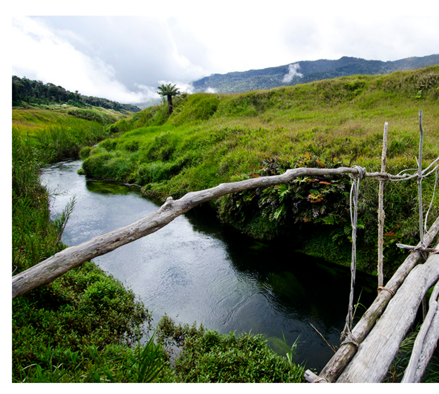
On the plains of Myola a five-star bridge replaces the usual ford or log crossings found at the majority of waterways on the Kokoda Trail.