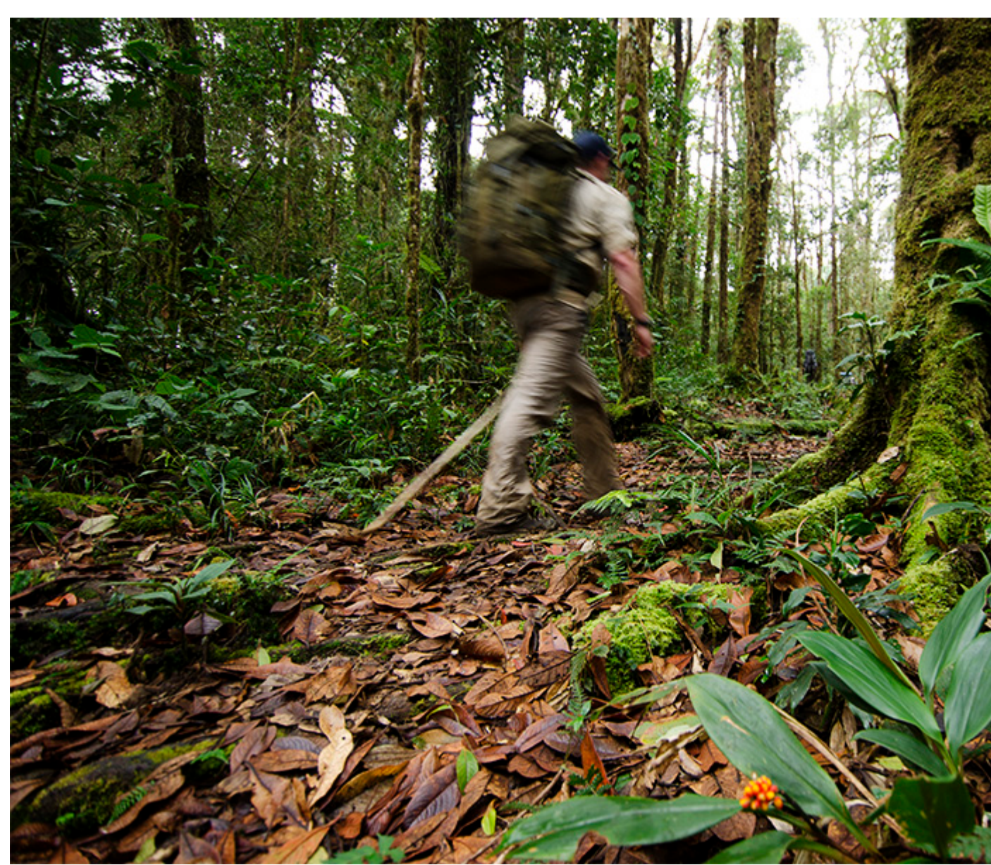
A highlight of the Kokoda Trail are the lush moss forests surrounding the extinct volcanic crater of Myola, where each footfall depresses a metre-wide depression upon the layers of rotting foliage as though walking on an enormous sponge.