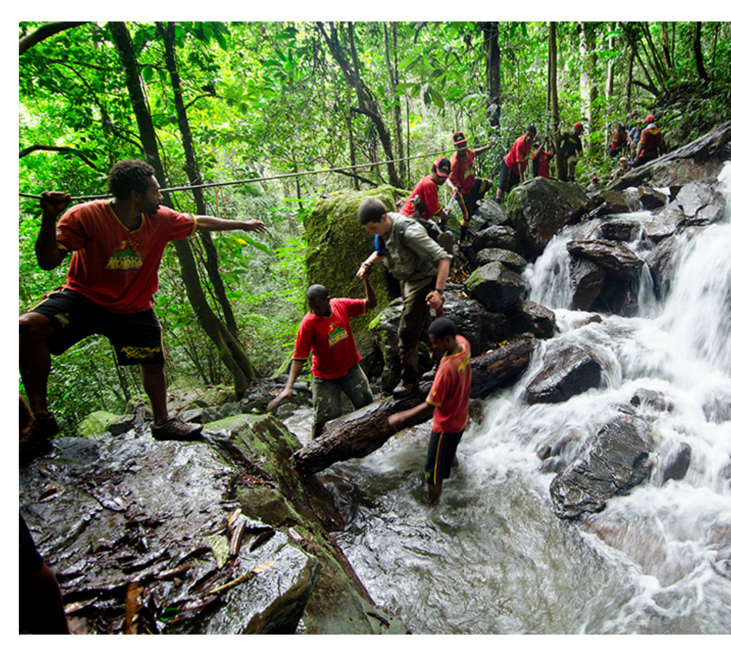
The gentle Koiairi and Orokaiava porters (descendants of the famous Fuzzy-Wuzzy Angles) form a human chain only meters above a sheer waterfall.